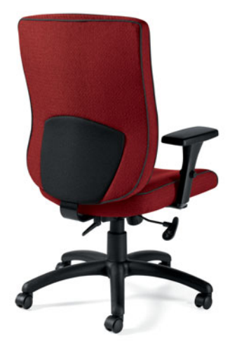
1970-4 High Back Tilter shown in Crescent Flame (705, Grade 4)